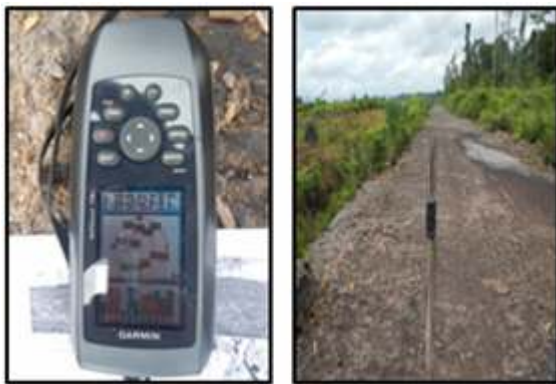
5B. Photo of verification team findingat GPS point S0°45'4.21" E109°52'45.27"