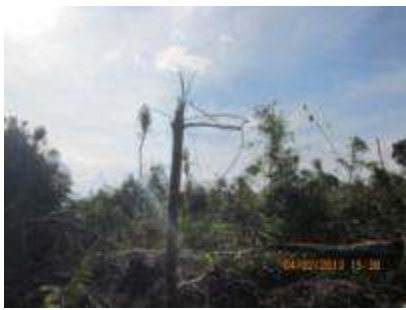
Picture B.5. West Direction, non-moratorium area