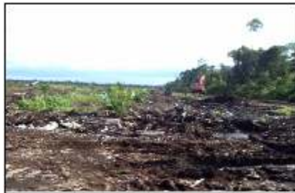
4A. at GPS point S0°45'17.78" E109°51'38.64"