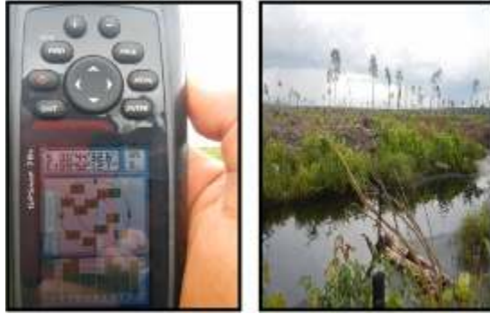
2B. Photo of verification team findingat GPS point S0°44'32.46" E109°52'12.14"