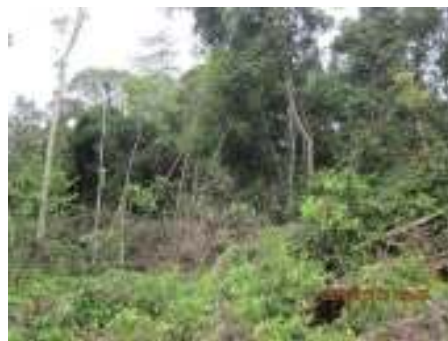
Picture A4. South direction, moratorium area