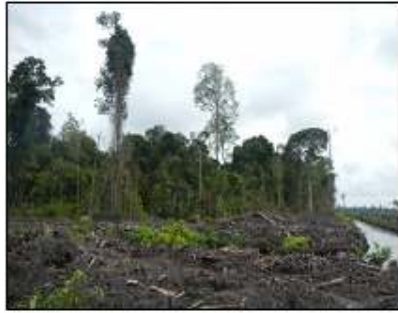
8C. Photo of verification team findingat GPS point S 0°41'56.20", E 109°56'22.62"