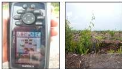
4B. Photo of verification team finding at GPS point S0°45'17.78" E109°51'38.64"