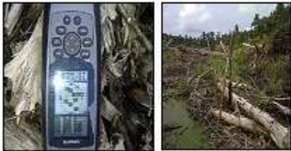
6B. Photo of verification team findingat GPS point S0°44'28.66" E109°53'16.35"