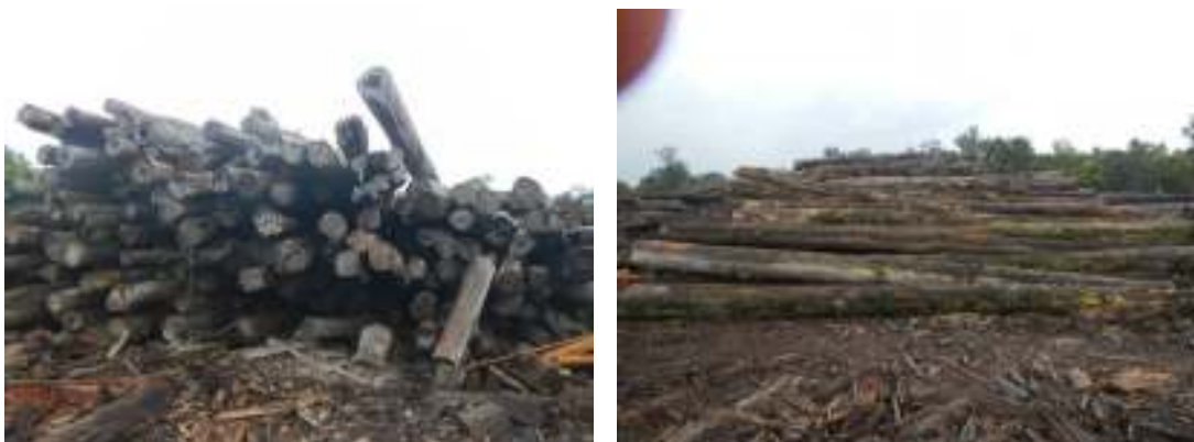
Picture D.1. Stacks of small logs in Log Yard Block 3 coordinate point 0°43'5.24" S 109°56'33.6" E

Stacks of logs totaling 1,288.94 m 3 were found in Log Yard Block 3 which was consistent with the logs reported by RPHK