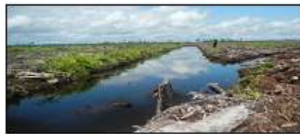
3B. Photo of verification team finding at GPS point S0°44'44.15" E109°51'40.30"