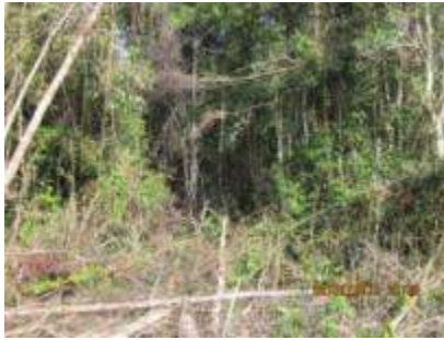
Picture B.3. East Direction, moratorium area