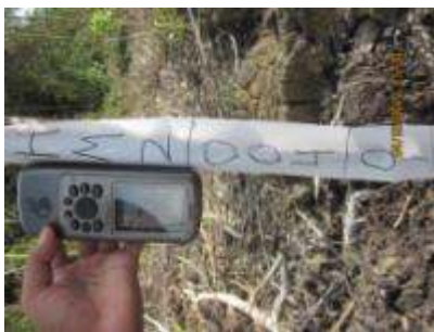
PictureB.1.Coordinate point S 0°42' 34.419", E 109°57' 12.758"

Observation of the photos taken during the moratorium area boundary deliniation by the FCP Implementation Team in February 2013 demonstrates that the natural forest logging had already been carried out in the area. However, the natural forest woods extraction and/or land preparation had yet to be completed. Samples of photo documentation from the boundary marking work in February 2013 are presented in pictures B.1-B.4. below.