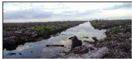
3A. Photo from RPHK report at GPS point S0°44'44.15" E109°51'40.30"