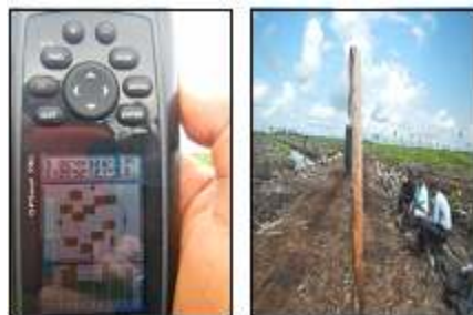
3B. Photo of verification team finding at GPS point S0°44'44.15" E109°51'40.30"