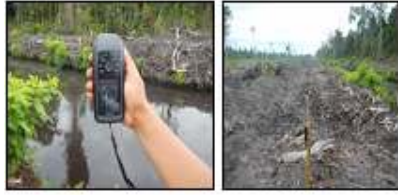
8B. Photo of verification team findingat GPS point S 0°41'56.20", E 109°56'22.62"