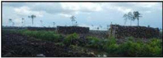
1C. Photo of verification team finding at GPS point S0°44'7.10 E109°51'47.39"