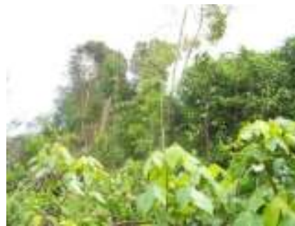
Picture C.4. East Direction, moratorium area