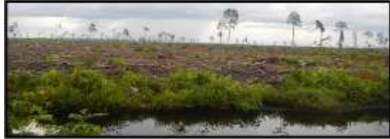
2C. Photo of verification team findingat GPS point S0°44'32.46" E109°52'12.14"

Findings at location of Photo 3 in Figure 1 from RPHK report The GPS point in photo 3 of Figure 1 in the RPHK report is located in the main road of PT. Gerbang Benua Raya, at coordinate point S0°44'32.46" E109°52'12.14" (in the boundary between the moratorium area and HTI development). The canal construction to the East and West part was completed by DTK prior to the moratorium on 1 February 2013. PT. Gerbang Benua Raya continued land clearance and preparation in the area after DTK stopped its activities. To the West of the coordinate an area has been planted with oil palm by PT. Gerbang Benua Raya with an age of approximately 6 months, similar to the Southern area nearby the PT. Gerbang Benua Raya camp site.