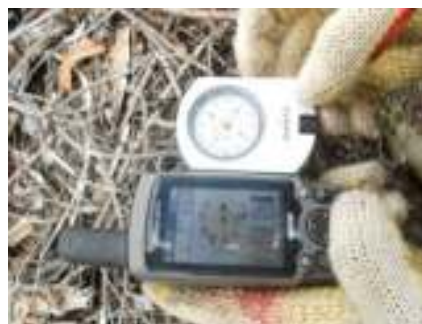
Picture C.2. Coordinate point S 0°46'7.371", E 109°47'39.713"