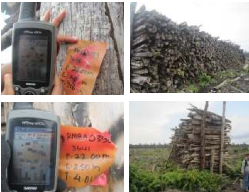
Picture C.7. Stacks of KBK woods at coordinate points S0^{\circ} 45'33'' , E 109^{\circ} 47'3'' And S 0^{\circ} 45'53'' , E 109^{\circ} 47'6''

The verification team did not find any breaches of the moratorium boundaries in relation to the existence of the wood. The condition of the wood observed on the landing is showed in picture C.7.