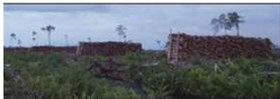
1A. Photo from RPHK report at GPS point: S0°44'7.10 E109°51'47.39"