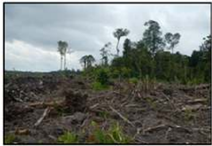
7C. Photo of verification team findingat GPS point S0°41'57.2" E109°56'14.95"