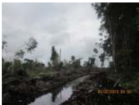
Picture A3. East direction, boundary of moratorium & non-moratorium areas