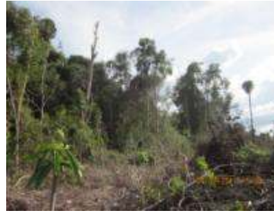
Picture B.4. South direction, moratorium area