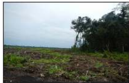
4C. Photo of verification team finding at GPS point S0°45'17.78" E109°51'38.64"