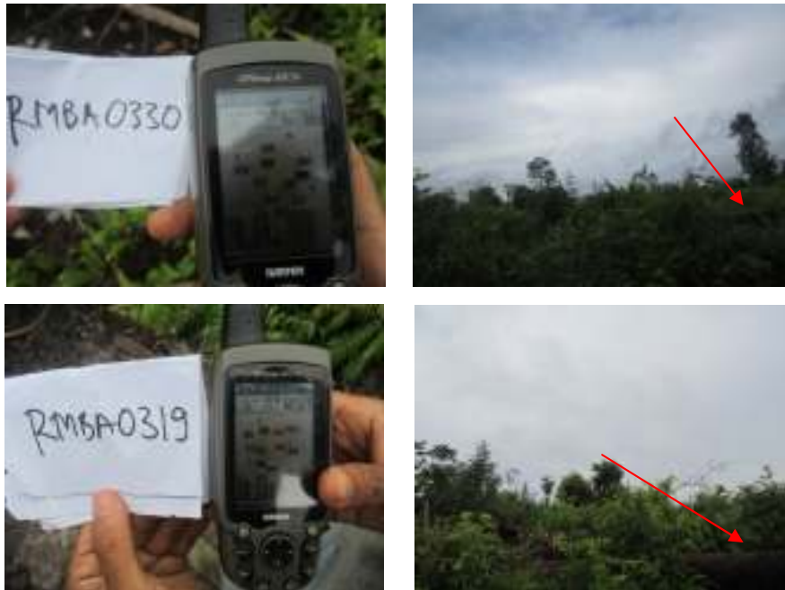
Picture C.8. Woods stock in the field at coordinate points: S 0° 44'51", E 109° 46'41" and S 0° 44'36", E109° 46'50"

The wood located in the field which has yet to be extracted and stacked is shown in picture C.8 below.