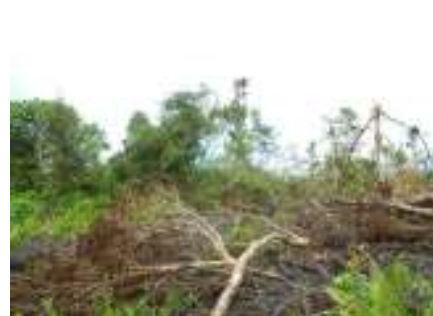
Picture C.6. West Direction, non-moratorium area