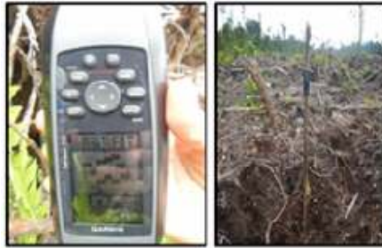
7B. Photo of verification team findingat GPS point S0°41'57.2" E109°56'14.95"