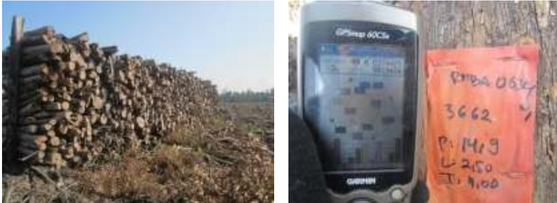
Picture D.2 Stacks of KBK at coordinate point S 0° 43'44", E 109° 52'17"

The observed KBK which have yet to be reported to the FCP Implementation Team were scattered in stacks located in 6 compartments: 2 compartments located in Area A and 4 located in Area B. The photos of field verification result are presented below: