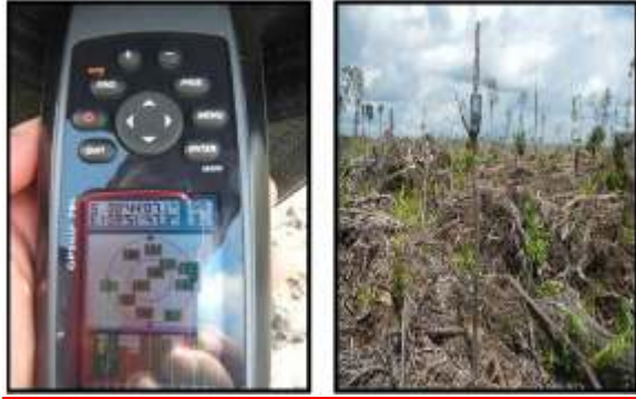
1B. Photo of verification team finding at GPS point S0°44'7.10 E109°51'47.39"