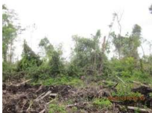
Picture A2. North direction, non-moratorium area