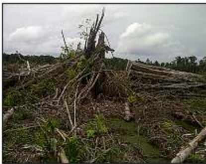
6C. Photo of verification team findingat GPS point S0°44'28.66" E109°53'16.35"