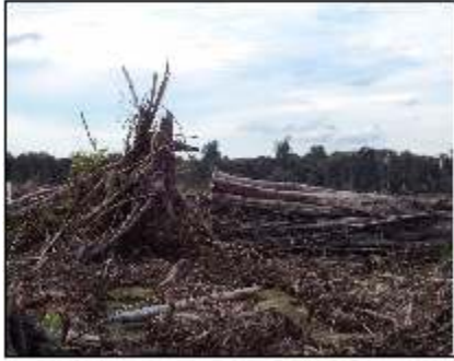
6A. Photo from RPHK report at GPS point S0°44'28.66" E109°53'16.35"