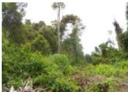
Picture C.5. South Direction, moratorium area