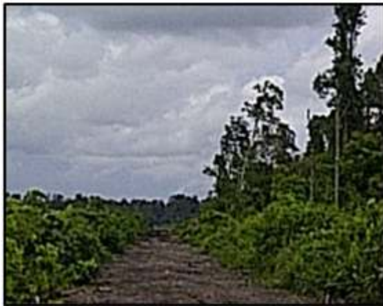
5C. Photo of verification team findingat GPS point S0°45'4.21" E109°52'45.27"