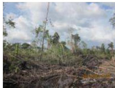
PictureB.2. North direction, non-moratorium area