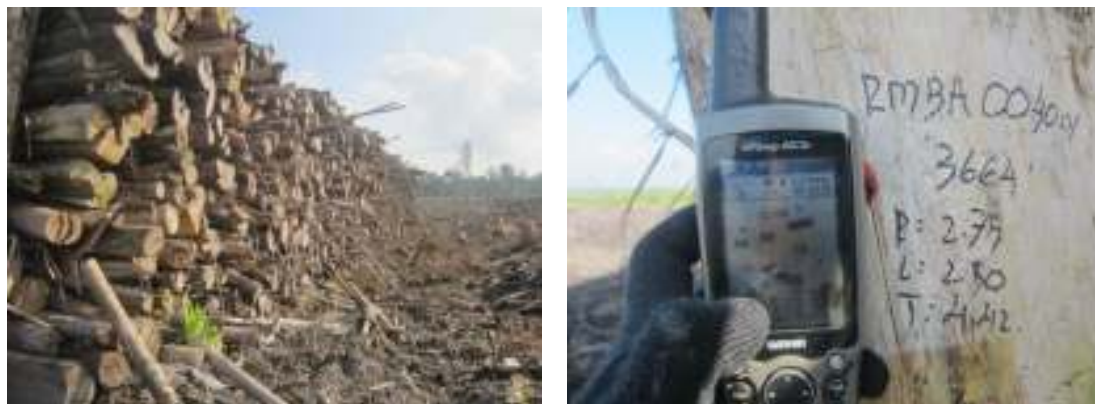
Picture D.3. Stacks of KBK at coordinate point S 0° 43'46", E 109° 52'17.9"

Interviews with TFT staff revealed that the FCP Implementation Team had socialized the moratorium protocol to DTK through a video conference with DTK staff and West Kalimantan Region SMF staff in January 2013.