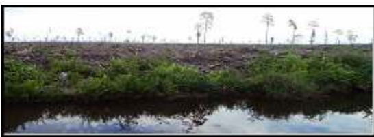
2A. Photo from RPHK report at GPS point S0°44'32.46" E109°52'12.14"