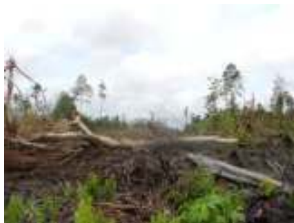
Picture C.3. North direction, non-moratorium area